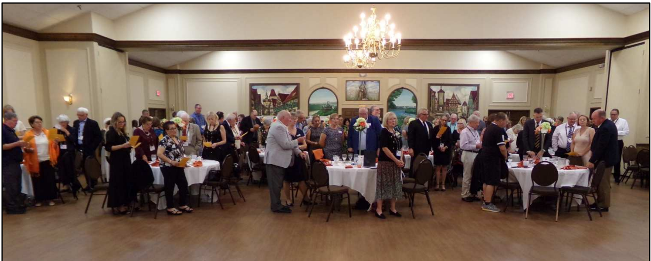
Above, some of the participants in the Convention Banquet on Saturday, September 10, 2022