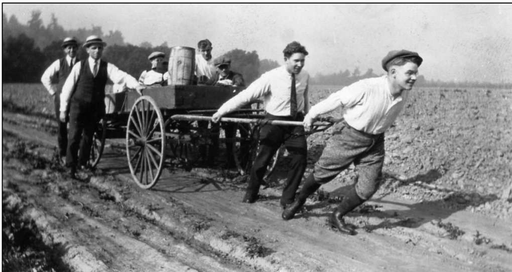
Left, Kolping members bringing refreshments for the camp building crew. That's one thirsty bunch!