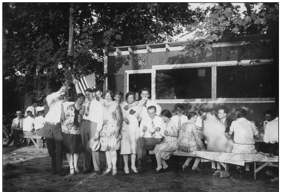
Right, Kolping members enjoying the beautiful day in front of the newly built Kolping Camp in 1925.