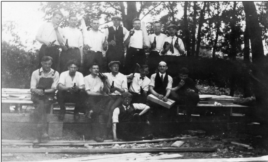
Above, the building crew of the first Kolping Camp along the Little Miami River It must be break time!

In January of 1937, the great flood in the Ohio River Valley unleashed its fury upon the region and the Kolping Camp stood 25 feet under water. It was still standing, though, and could be seen from a distance. Evidently the camp could be somewhat salvaged from the flood, since the members had a camp opening celebration in 1938, but by the end of 1938, Cincinnati Kolping could no longer renew the lease on the property, so they were forced to look for a new summer camp. Those long summer days at the Kolping Camp along the Little Miami River were over, and now it was on to the Muehlenhardt Farm on Winton Road, which became known as "Kolping Grove". Photos of the Kolping Camp are below and on the following pages.