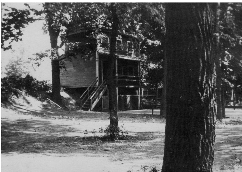
Left, the new two-story camp built in 1932.