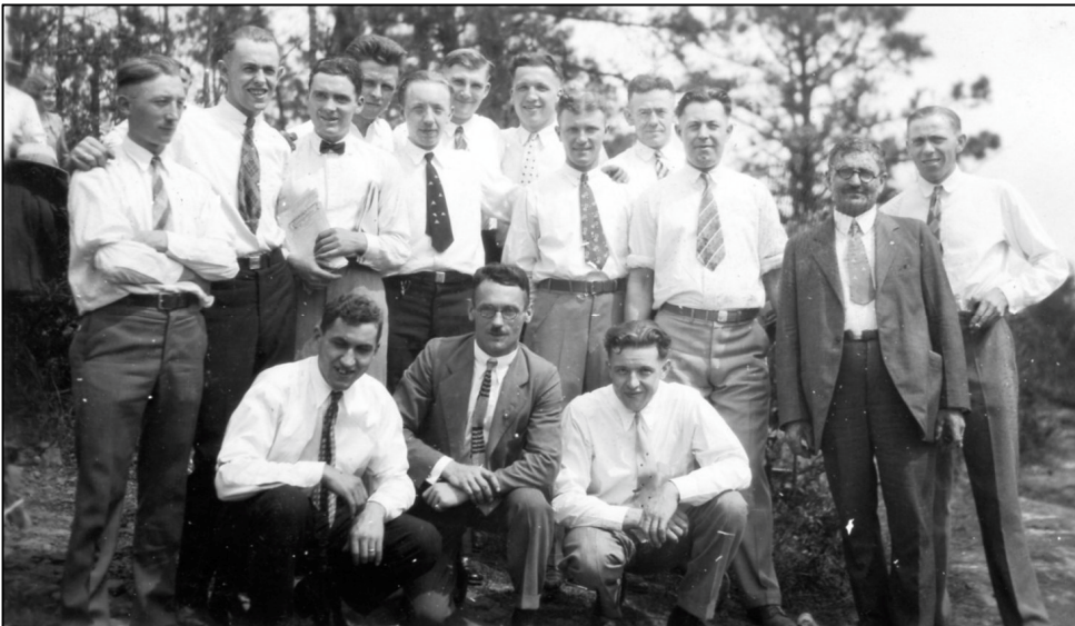
Left, the Kolping Choir in 1927

So you can see, the German music tradition is alive and well at Cincinnati Kolping!