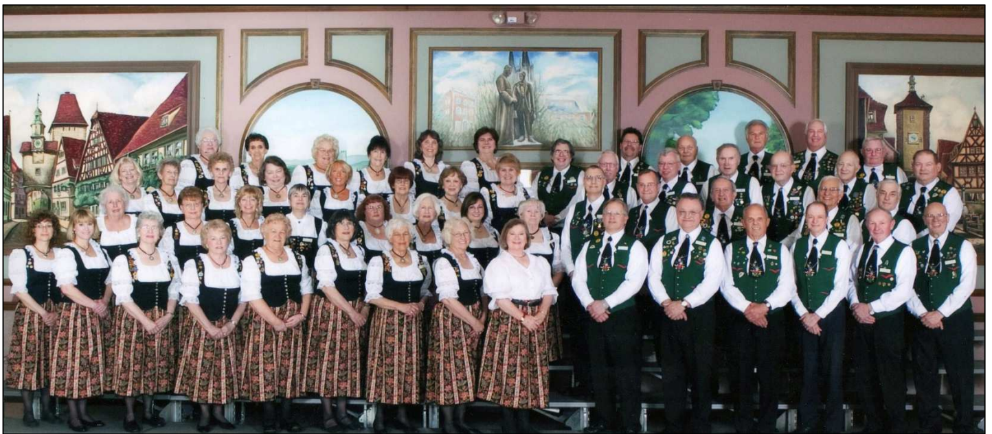
Top, the Kolping Sangerchor singing with the Cincinnati Pops Orchestra and the Von Trapp Family Grandchildren at Riverbend Music Center, August 9, 2008.