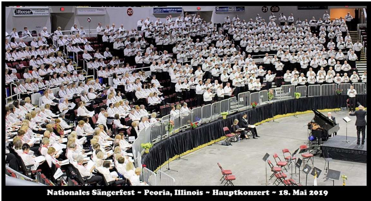
Photo of some of the participants at the National Sängerfest in Peoria, Illinois on May 18, 2019 where the Kolping Sängerchor participated.